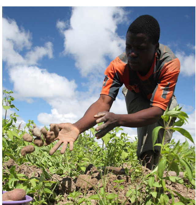
The different frames shows (Frame 1) leaders in a discussion forum at COP 26. Frame 2 & 3 shows yields by farmers after a succesful harvest highlighting the need to create normal life for all.