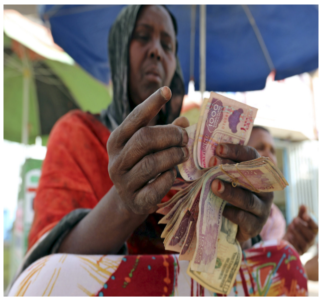
A trader counting their money in a market in Africa (Image courtesy of Brookings institute).

The third is the finance gap. Even as Glasgow parties agreed to double the $100 billion pledge to developing countries, Africa already needs a minimum of $2.5trillion to implement its climate action commitments. This means that even if the pledges were honoured in full, the gap would still be gapping. At the same time, the region already invests in adaptation at the rate of 2% of GDP each year. The guestion is how the region can bridge the finance gap using what it already has. One area that is a big win for the region was the finalization of the rule book, with key issues of Article 6 being ironed out. This is to say that the region can leverage Article 6 to mobilise market financing to drive key NDCs action in the two most critical sectors to the just transition - agriculture and clean energy - that are already prioritised in over 70% of NDCs. For example, Article 6.2 on Internationally-Transferred Mitigation Outcomes allows countries that are considered the highest emitters to partner with low emitters across the globe including in Africa – and agree on how their high emissions can be offset through investing in supporting a low emission action within the territories of low emitters.