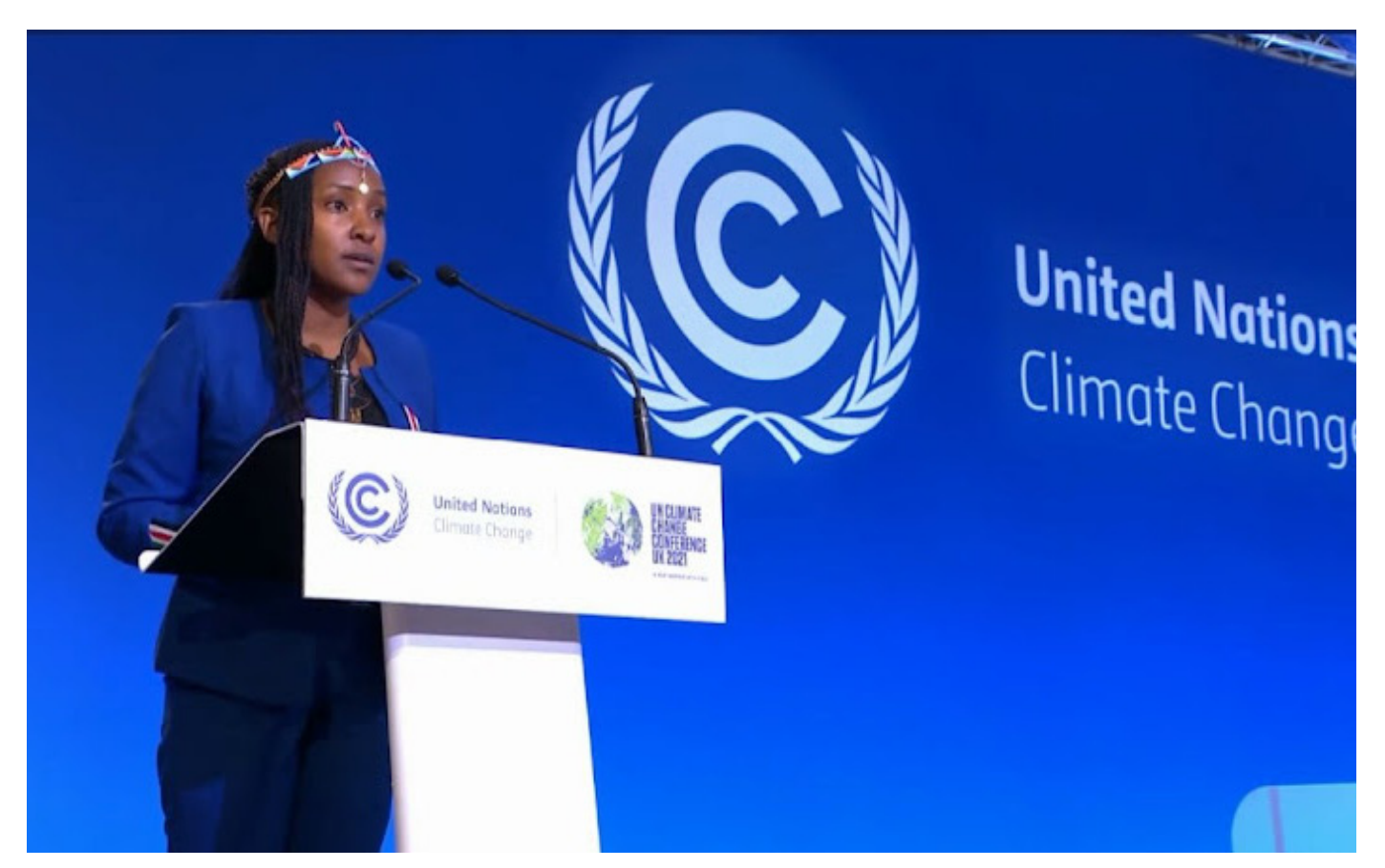
A strong and passionate call from a 26-year-old African climate activist as she spoke to the world leaders on the first day of the world leaders' summit of the COP 26 hosted by Prime Minister Boris Johnson. The call for action transcends the different levels of society members from governments to activists.

Africa, due to its negligible emissions, is a natural supply market here. But the key to Africa's benefit should be on how well such market mechanisms are tied to catalyse the growth of competitive low carbon enterprises on the continent. While typical areas of investment have been in reforestation, Africa should take a strategic stance and prioritise how any collaborations towards reforestation will enhance much needed economic productivity. Creating of jobs for youth, enhancing food security to drive a trajectory of competitive economies is key. Here, collaboration to invest in clean energy aligned to powering agriculture value addition enterprises will be unlocking up to $48 billion worth of PHLs, as positive financing tied to power a just transition. Africa should look at investing its 2% of GDP contribution to climate action to forging collaborations under Article 6 that unlock such tangible enterprises to implement up to 70% of its NDCs while unlocking key socioeconomic opportunities to drive a just transition.