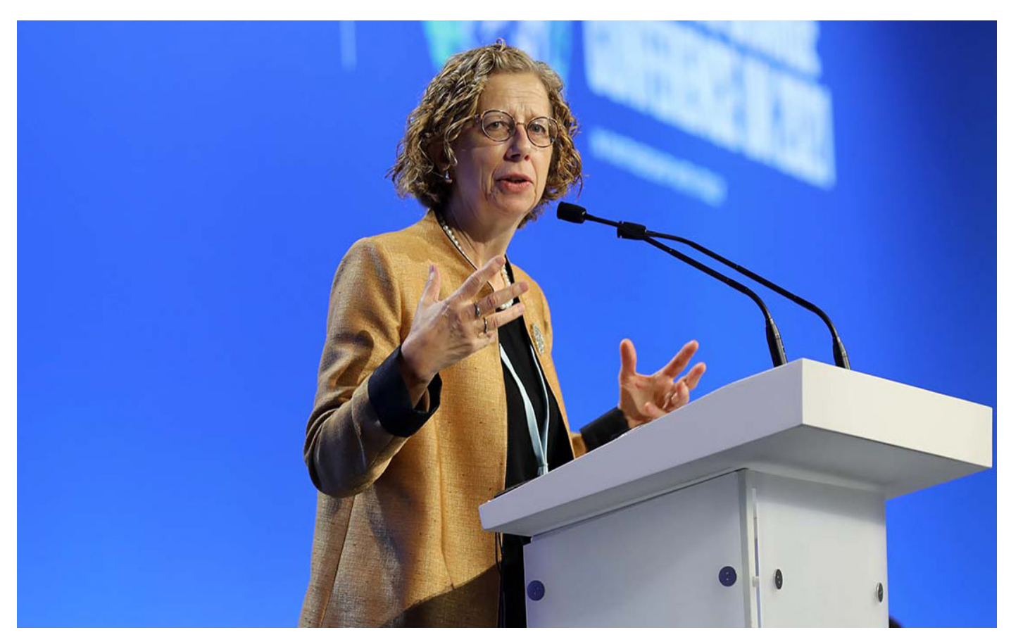
UNEP Executive Director Inger Anderson making a presentation at the COP 26 in Glasgow. She urged the rest of the world to ramp up support for the fight against Climate Change.

Mauritius has targeted 40%. Mauritania targets emissions cut to the tune of 92.49% conditional & 11% unconditional. Kenya has set a target of 32%. etc. These are examples demonstrating the continent's commitment to cut emissions. But while impressive, these emissions cuts need to be considered in the context of achieving a just transition for a region that remains a negligible emitter yet disproportionately vulnerable because of a low socioeconomic base.